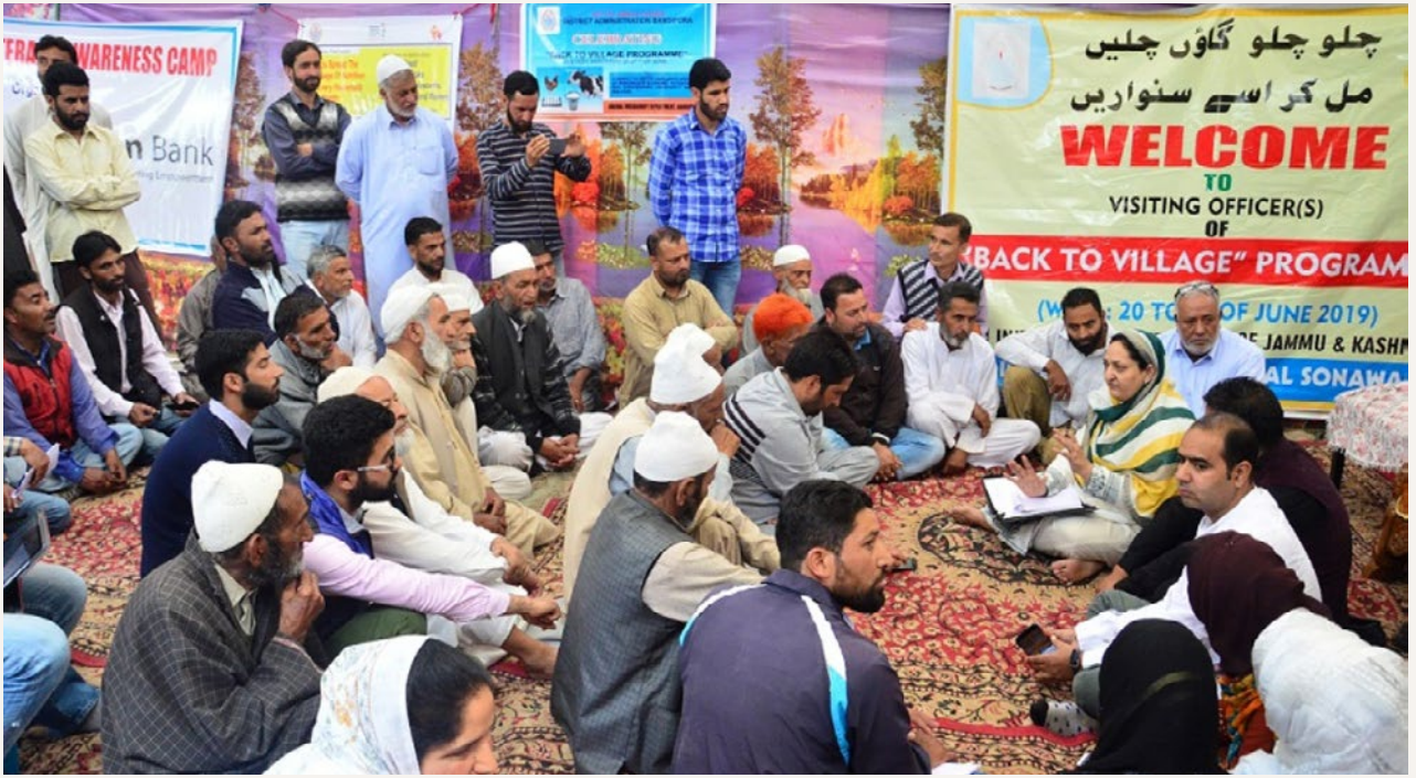
Officials during 'Back to Village' programme at north Kashmir's Bandipora district

In my interactions with the people, I have often found them to be full of appreciation for the Centre's welfare schemes like the Golden Card Scheme offered by Ayushman Bharat. They are full of praise for the development of roads and infrastructure.